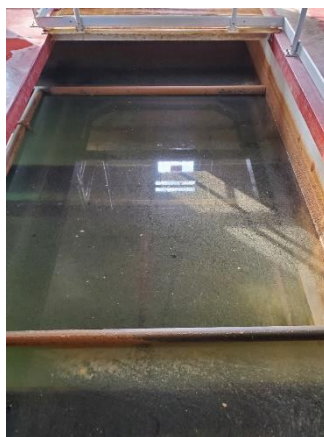
Left: Without LowDose™ control Right: After LowDose™ control